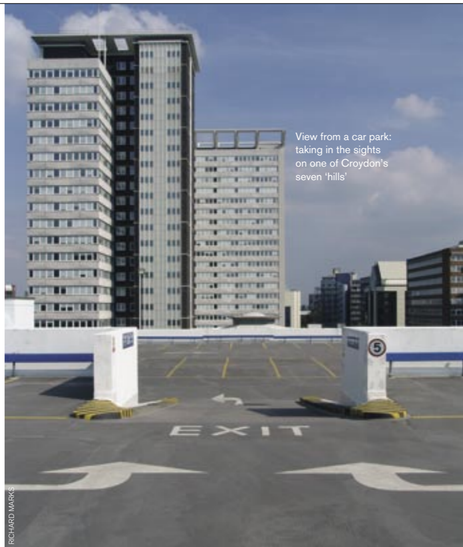
View from a car park: taking in the sights on one of Croydon's seven 'hills'